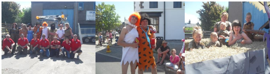
DALTON CARNIVAL 2010

South Lakes Search & Rescue were honoured to have attended Dalton Carnival this Year and thanks to the people of Dalton and surrounding area's for a warm welcome , We as a Team had a Fantastic Day and would like to thank the Committee for selecting us as one of there beneficiaries.